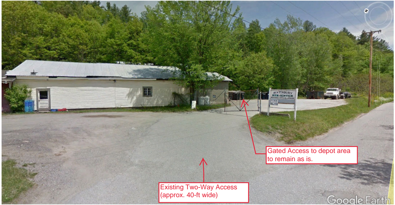
Existing Access serving Redemption, Recycling and Rubbish Removal Station