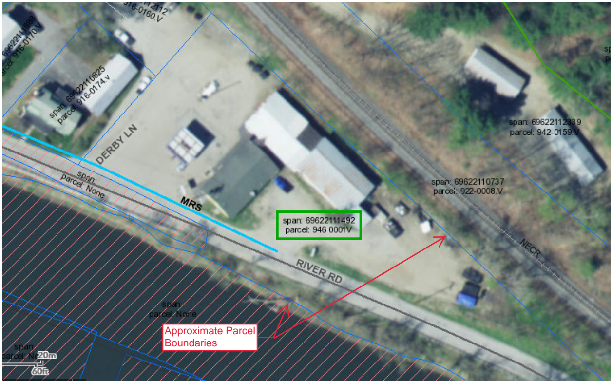
Parcel Map with Ortho Imagery – Existing Conditions